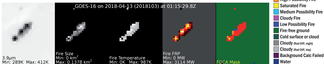
GOES-16 imagery of the Rhea Fire in Oklahoma on April 13, 2018, showing the ABI 3.9 \mu\text{m} shortwave infrared band (left column), and the various outputs of the fire detection and characterization product. From left: fire size, fire temperature, and fire mask. Fire radiative power is shown in colors from black to red for 0 to 1000 megawatts (MW), red to yellow for 1000 to 2000 MW, and yellow to white for 2000-3000 MW.

The FDC product looks for hot spots, attempts to determine the background temperature without fire present, corrects for solar contamination and water vapor attenuation, and provides fire characteristics for the detected